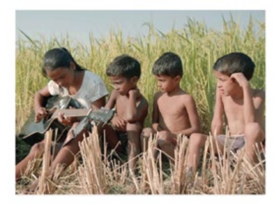
In her 2017 docu-drama Village Rockstars, Rima Das explored life in a small

Rima Das returns to rural Assam to follow-up her 2017 docu-drama