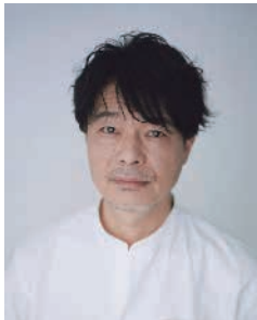
Judge Satoshi Nikaido